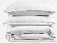
Fringed Cotton-Linen Quilt Cover Set