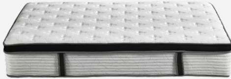
Chiro Plush Euro Top Pocket Spring Mattress