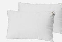
Superior Support Cotton Pillows