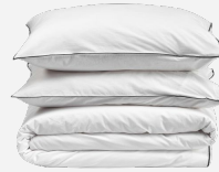
Organic Cotton Quilt Cover Set