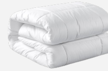
Bamboo Polyester Blend Quilt