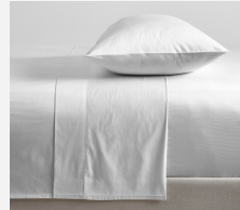
Organic Cotton Sheet Set