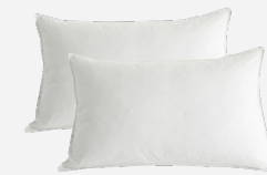
Wool Blend Rich Standard Pillows