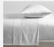
1000 TC Cotton Rich Sheet Set