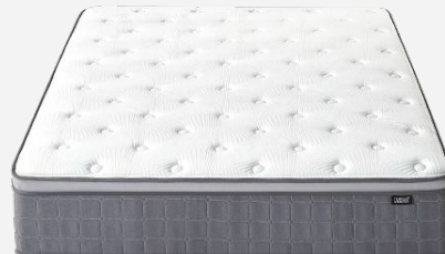
Dreamy Premium Green Tea Memory Foam Pocket Spring Mattress