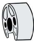
Wired Mounting Bracket