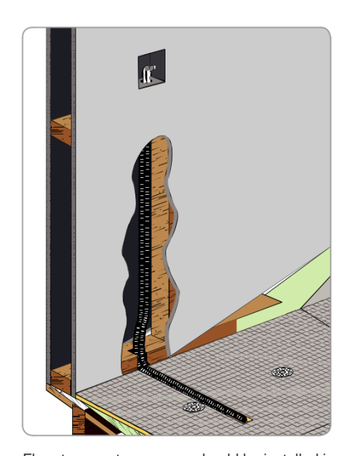
Floor temperature sensor should be installed in a conduit, within a clear area of the floor, and away from any other temperature influences.

Manually boost your underfloor heating and towel rail until the next heating event or for 1, 2 or 4 hours