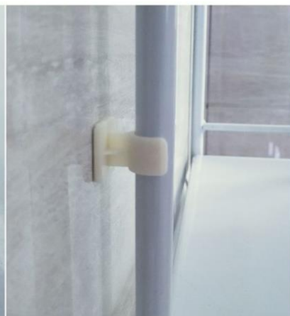
Step 10. Put the reinforcing button on the wall and connect the over toilet rack.