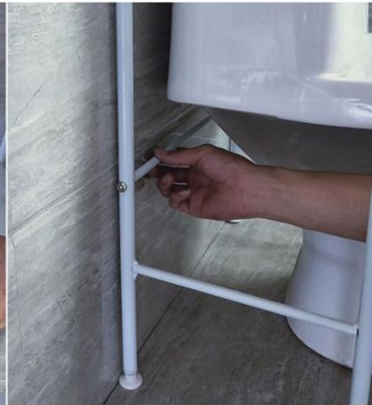
Step 7. Please set it to flush toilet, and then connect the cross bars of lower part rack. (If without space, don't connect it.)