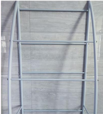
Step 5. The cross bars connect the upper part rack.