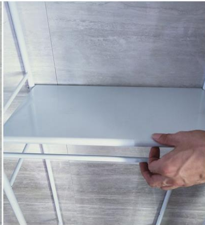
Step 6. Put the surface panels.