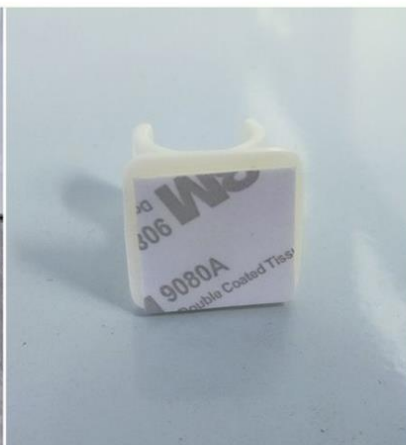
Step 9. Reinforcing button-stick as picture.