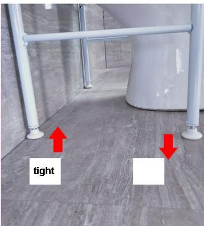
Step 8. Adjust the bottom stands. (Please make the rear bottom stands more tighter than front. see picture)